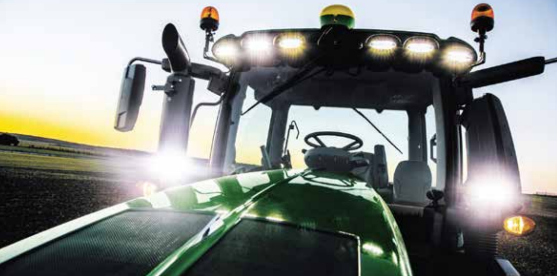
Slimline LED Lighting £26.10